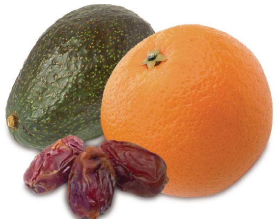
Products that commonly come from Israel and the settlements.

We call on those of our fellow Jews who are inclined to support the State of Israel unconditionally to think critically about what Israel does in our names. We call on every ethical consumer, of any faith or none, to refuse to support the Israeli economy for as long as the illegal occupation and exploitation of Palestine persists