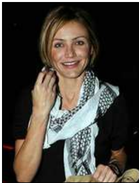
Cameron Diaz sports a keffiyeh

6. The kuffiye is a Palestinian scarf which has come to have symbolic value as representing Palestinian identity and their struggle to stay on their land. In the past few years, a scarf modeled on it has been selling in shops like Top Shop and Urban Outfitters and worn by stars who often don't know what the original kuffiye is.